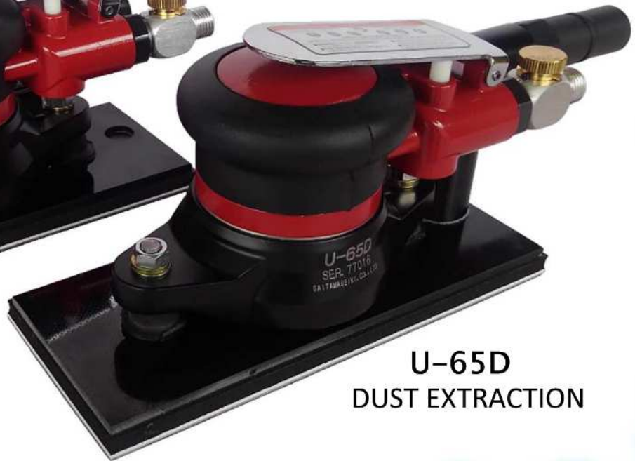
U-65D DUST EXTRACTION