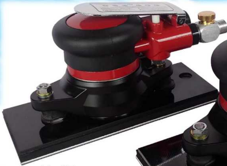
U-65 NON DUST EXTRACTION