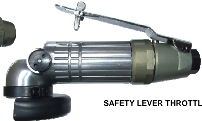
SAFETY LEVER THROTTLE