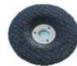
Grinding Disc 50x3x9.53mm