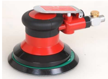
● AK-551 5" Double Action Sander ● AK-56 6" Double Action Sander