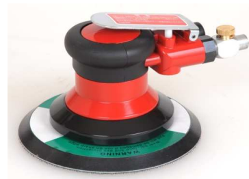
● Special pads for AK-551 ● AK-556 5" Double Action Sander