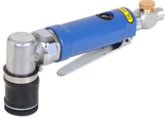
● AK-51 1.2" Mini Double Action Sander ● AK-52 Mini Double Action Sander

Widely used at various industries of car body repairing, wooden working, metal working, FRP working, etc. with AK-TOOL's excellent sanding program. Tools are of low vibration, low gravity center, well-balanced.