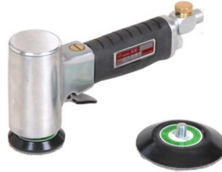
● AK-54 4" Double Action Sander ● AK-55 5" Double Action Sander