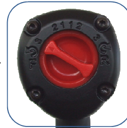
REVERSE LEVER with AIR REGULATOR